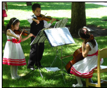
Live musicians from the July 2nd Lunchtime at the library

We know it's a season away, but please put the 2014 CFOL Fall Festival on your calendar now: Saturday, October 18, 11 am to 2 pm. Hope to see you there!