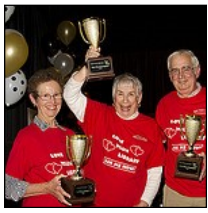
The winning Chico Friends of the Library Trivia Bee team from 2012

Funds raised will support Butte County Library Literacy Services that include the Adult Reading Program, the mobile Literacy Coach, and the Library Playtime and Babies Love Books programs, because it's never too late nor too early to learn to read. Your generous contributions will help to buy supplies such as learner workbooks, learning evaluations, and learner and tutor workshops.