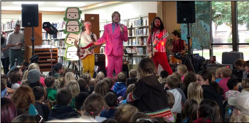
Yule Logs Fill the Library to Bursting with Youngsters, Oldsters, and Cheerful Holiday Music

Meriam Library from 1970 until she retired in 1985.