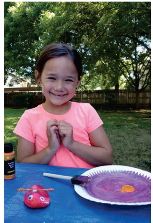
Children enjoying the Summer Reading program